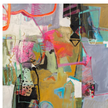
After The Party 30x30in Canvas