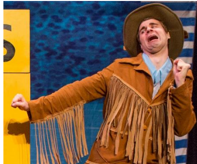
"Cocoa the Horse" in the play DRAGONS LOVE TACOS & OTHER STORIES