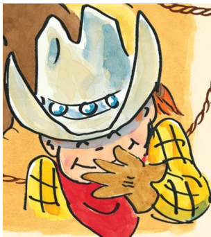
"Cowgirl Katie" in the book COWGIRL KATE & COCOA: SCHOOL DAYS