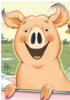
"Mercy Watson" in the book MERCY WATSON GOES FOR A RIDE