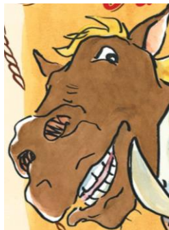
"Cocoa the Horse" in the book COWGIRL KATE & COCOA: SCHOOL DAYS