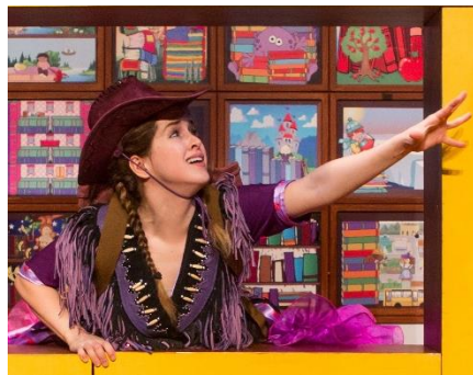
"Cowgirl Katie" in the play DRAGONS LOVE TACOS & OTHER STORIES