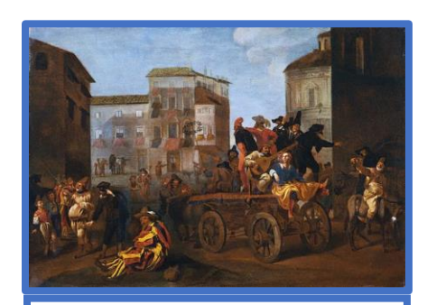
Commedia dell'arte Troupe on a Wagon in a Town Square, by Jan Miel, 1640

Italian performers turned these elements into their own genre of called Commedia dell' Arte. This was street performance where a troupe of actors would tour around Italy improvising comedic situations with standardized movements. The comedy was often very